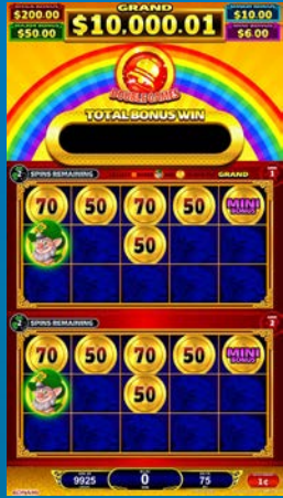
Bonus Coin Awards

In addition to the triple bonus features, players can also win jackpot awards during the Charms Full Link Feature, including the following: