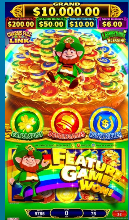
Charms Full Link Feature

Whenever 6 or more Coins of any color are collected, the Charms Full Link Feature is awarded, populating a bonus reel frame in the style of Konami's player-favorite All Aboard. Three spins are awarded at the start of the feature, resetting anytime a Leprechaun symbol lands. All reel positions are independent, containing only Leprechaun symbols and blank spaces. For any spin that results in a Leprechaun symbol, all displayed credit prizes are collected. After, the Leprechaun symbol transforms into a random prize symbol, the feature continues. Coin symbol amounts scale by denomination. Based on the colors of the Coins that triggered the feature, players can unlock any combination of the following bonuses—up to all three at once!