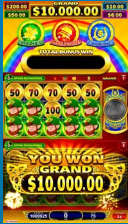
Grand Jackpot Award