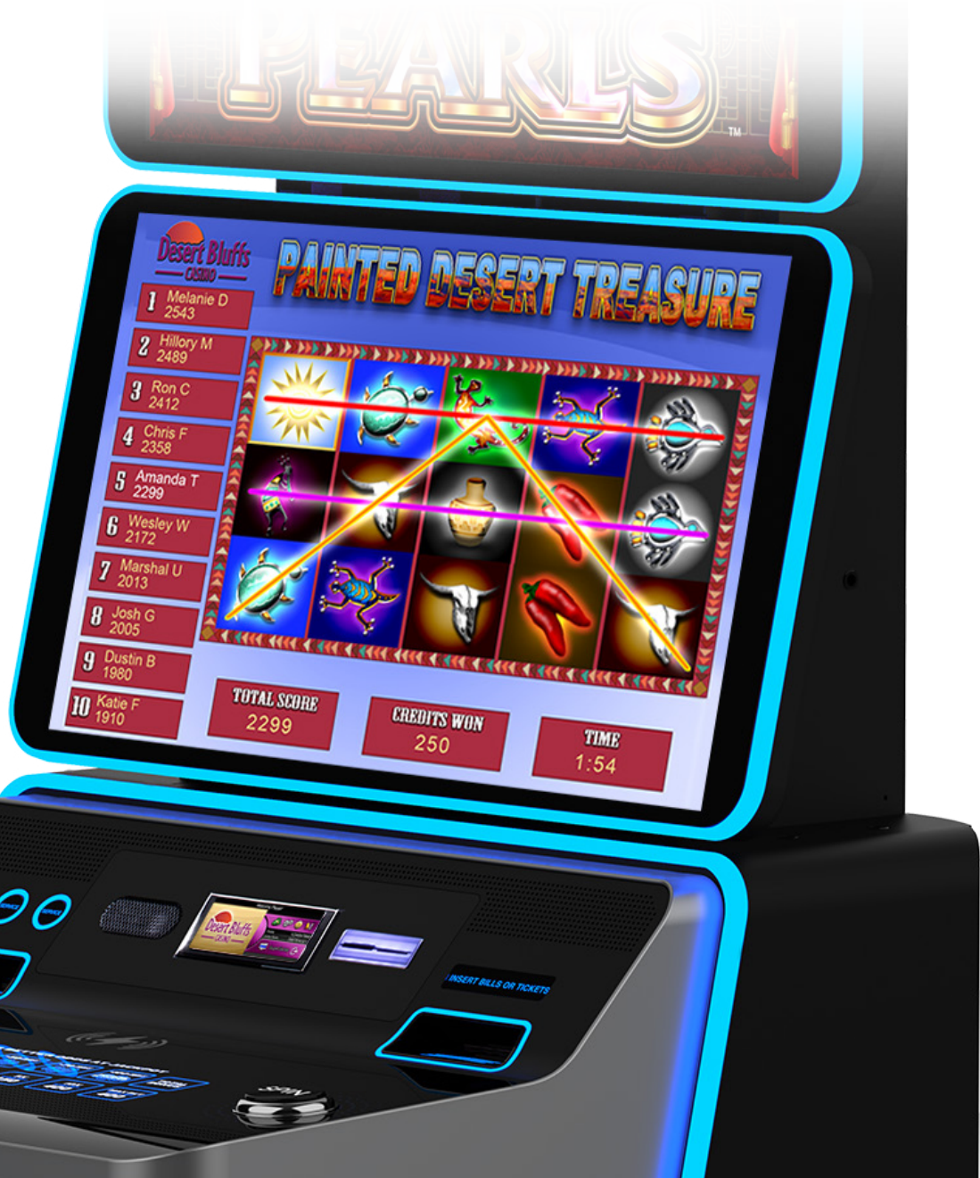
Custom-branded True-Time Tournaments